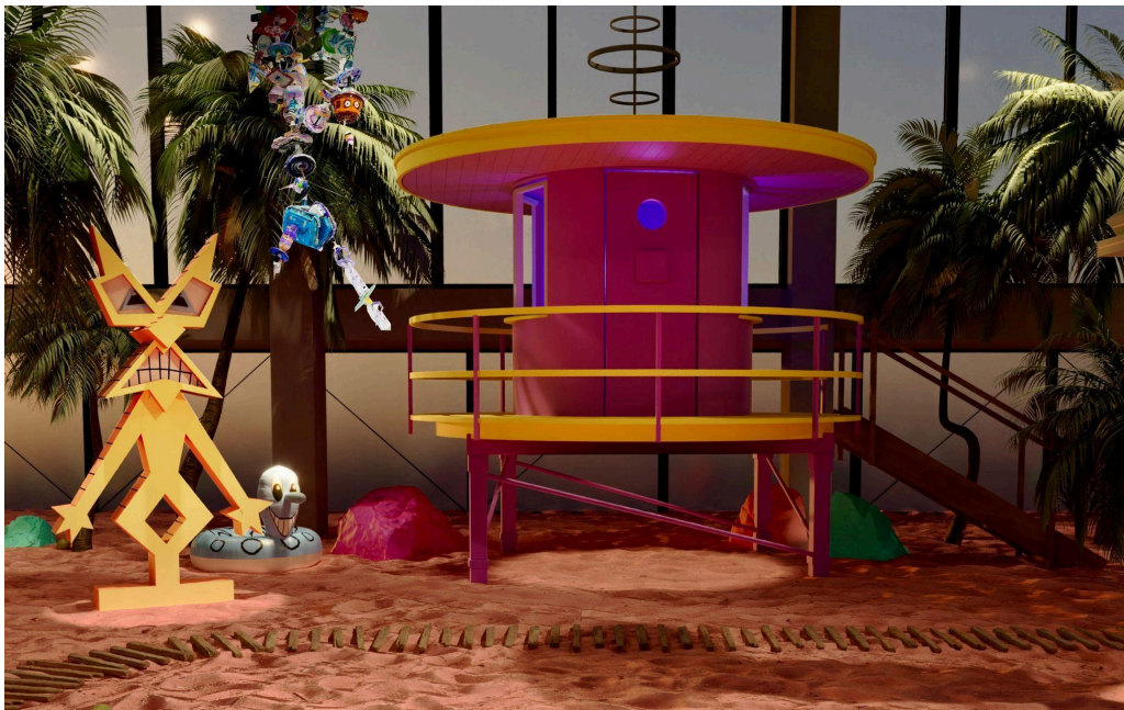
Rendering of Kenny Scharf Beach Club; credit: Stefano Lattanzio

Scharf's illustrated creations often transcend canvases and are applied to surfaces ranging from household appliances to automobiles and extend into experiences that blur the line between art and lifestyle. This sentiment comes to life with the Beach Club concept where an entire floor of MAM Shanghai is converted into a quintessential beach adventure inspired by Scharf's daily swimming routine. The installation captures the sunny, lighthearted, and breezy energy of Venice Beach with delicate sand, emerald green palms, beach huts, and vendor stands that have Scharf-designed memorabilia that blend kitschy nostalgia with his signature pop art aesthetic.